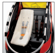
Weber baby seat Can be securely fastened in a flat position.