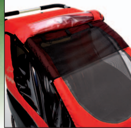
The hood has an insect net and sunshade and can be set in several positions.