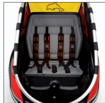
Flexible and user-friendly 5-point safety harness guarantees optimal safety. Safety harness, seat padding and bags are washable.

Another unique product feature is the adjustability of the back rest to allow a comfortable sleeping position. The seats and belts have soft padding. The flexible 5-point safety harness guarantees optimal safety in the shoulder and pelvis area and is very user-friendly. A child can now easily be strapped in the centre. On each side of the cabin there is a large removable pocket made of hard-wearing fabric that can be handwashed at a maximum of 40 °C (as can the belts and seat padding).