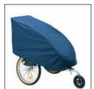
Rain cover - Garage