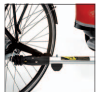
Weber coupling E