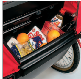
Large integrated cargo area with a low centre of gravity.