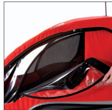
Optimal ventilation The side windows can be opened easily with a zip. The front window can be rolled up and stored between the net and the hood.