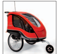
Buggy wheel The Dolphin can be easily converted into a buggy using the buggy wheel.