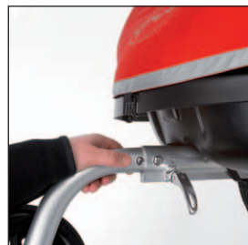
The towbar and buggy wheel can be easily fitted using a spring button and can be fastened using quick release clamps.